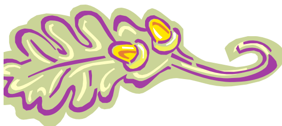
The North Carolina State tree is the Longleaf Pine