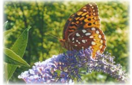
Gavin Mortenson 2013 Elementary Winner

For contest rules, visit: www.greensboro-nc.gov/PhotoContest . Deadline: March 8 between 6 - 8 pm. Kathleen Clay.