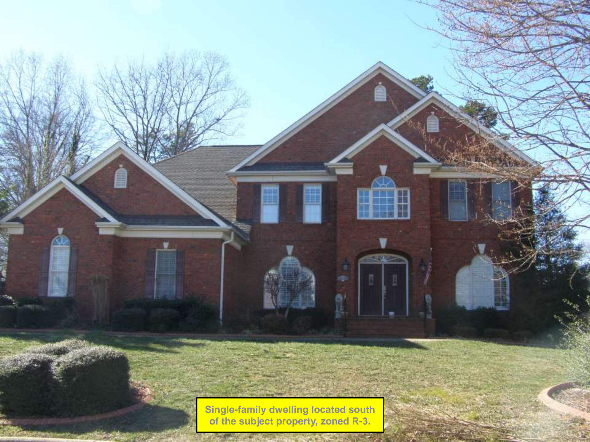
Single-family dwelling located south of the subject property, zoned R-3.