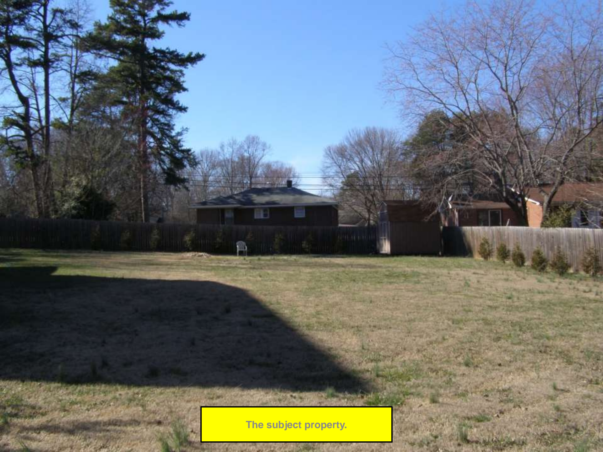
The subject property.