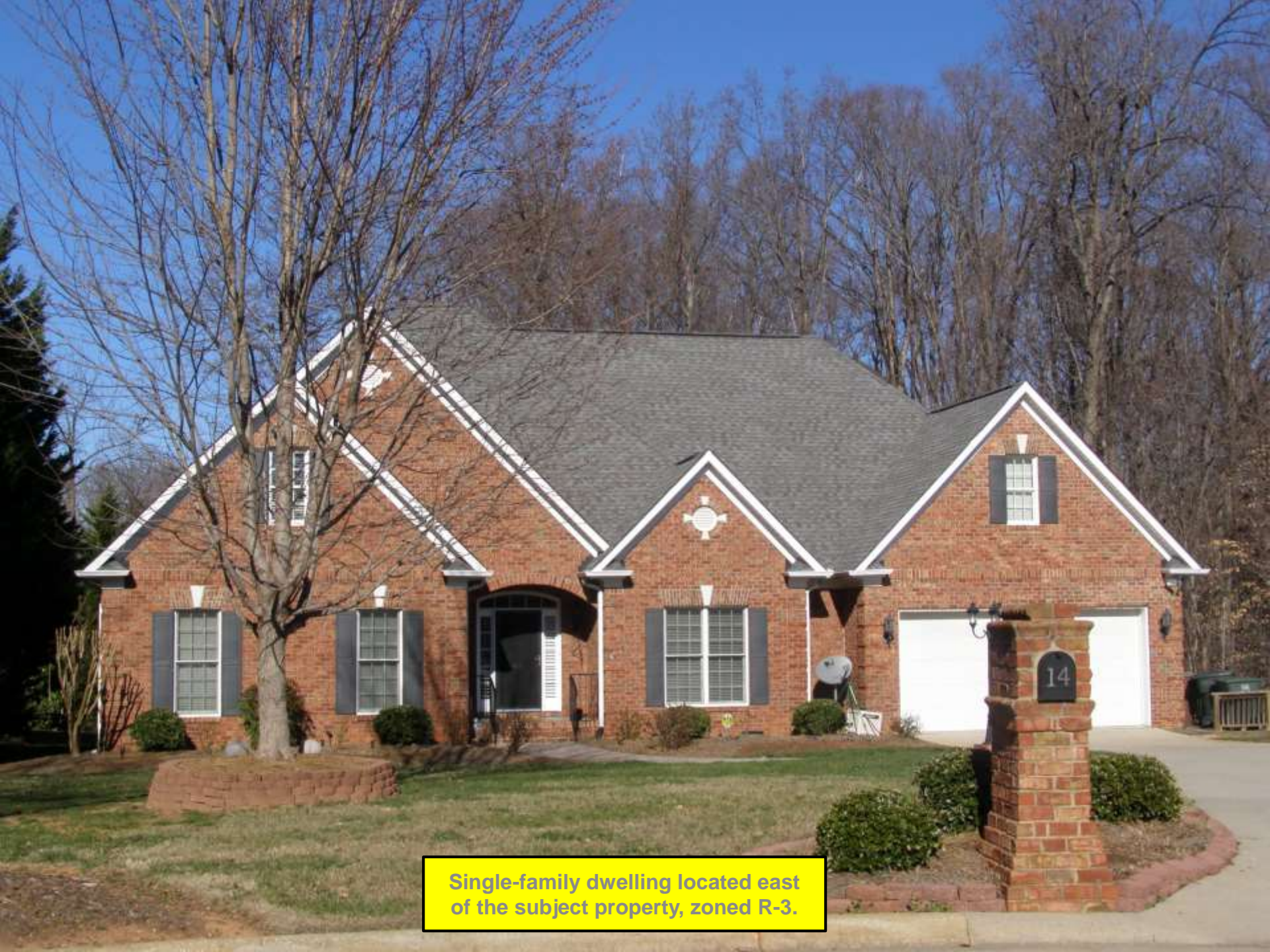
Single-family dwelling located east of the subject property, zoned R-3.