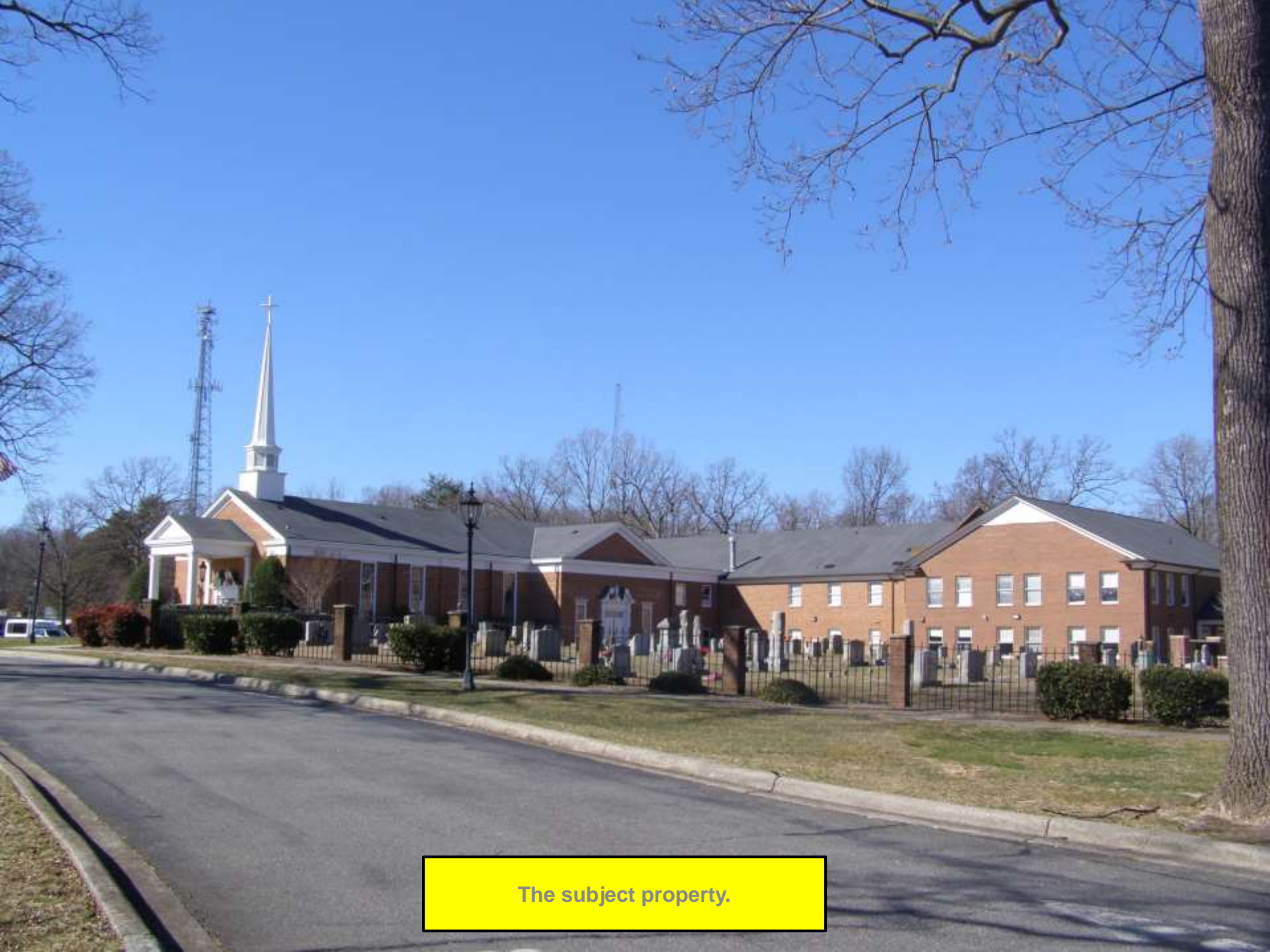
The subject property.