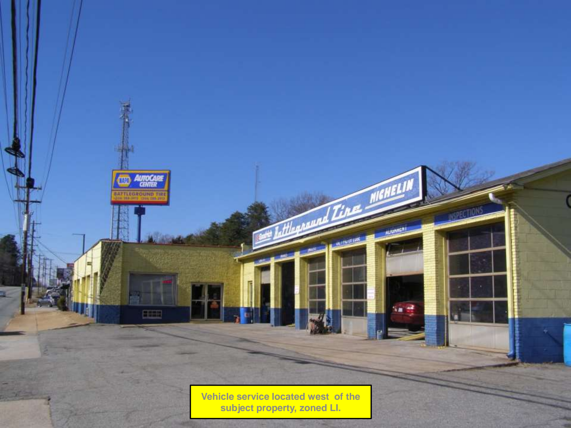
Vehicle service located west of the subject property, zoned LI.