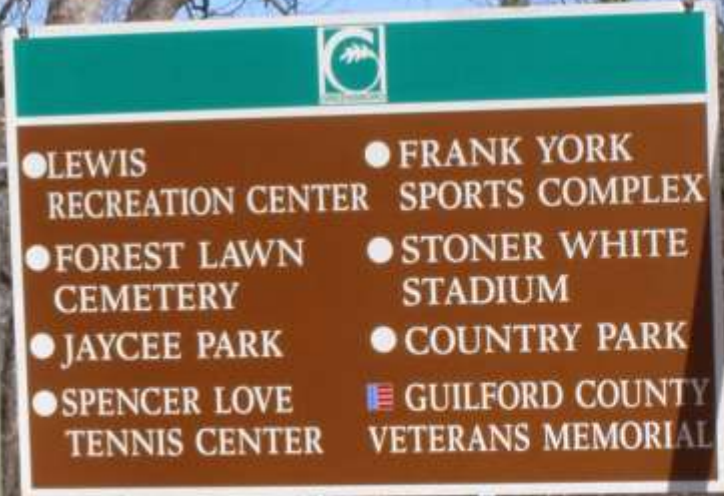
Lewis Recreation Center located north and east of the subject property, zoned PNR.