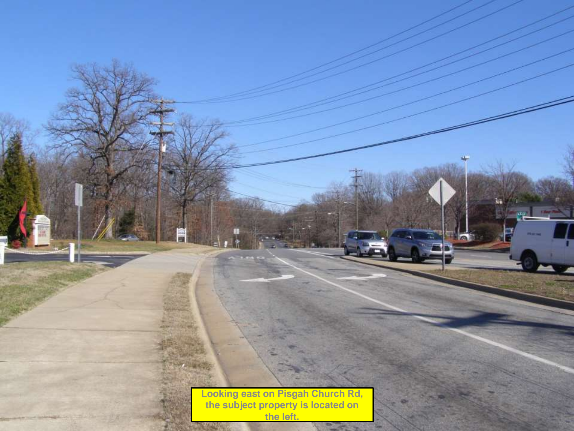
Looking east on Pisgah Church Rd, the subject property is located on the left.