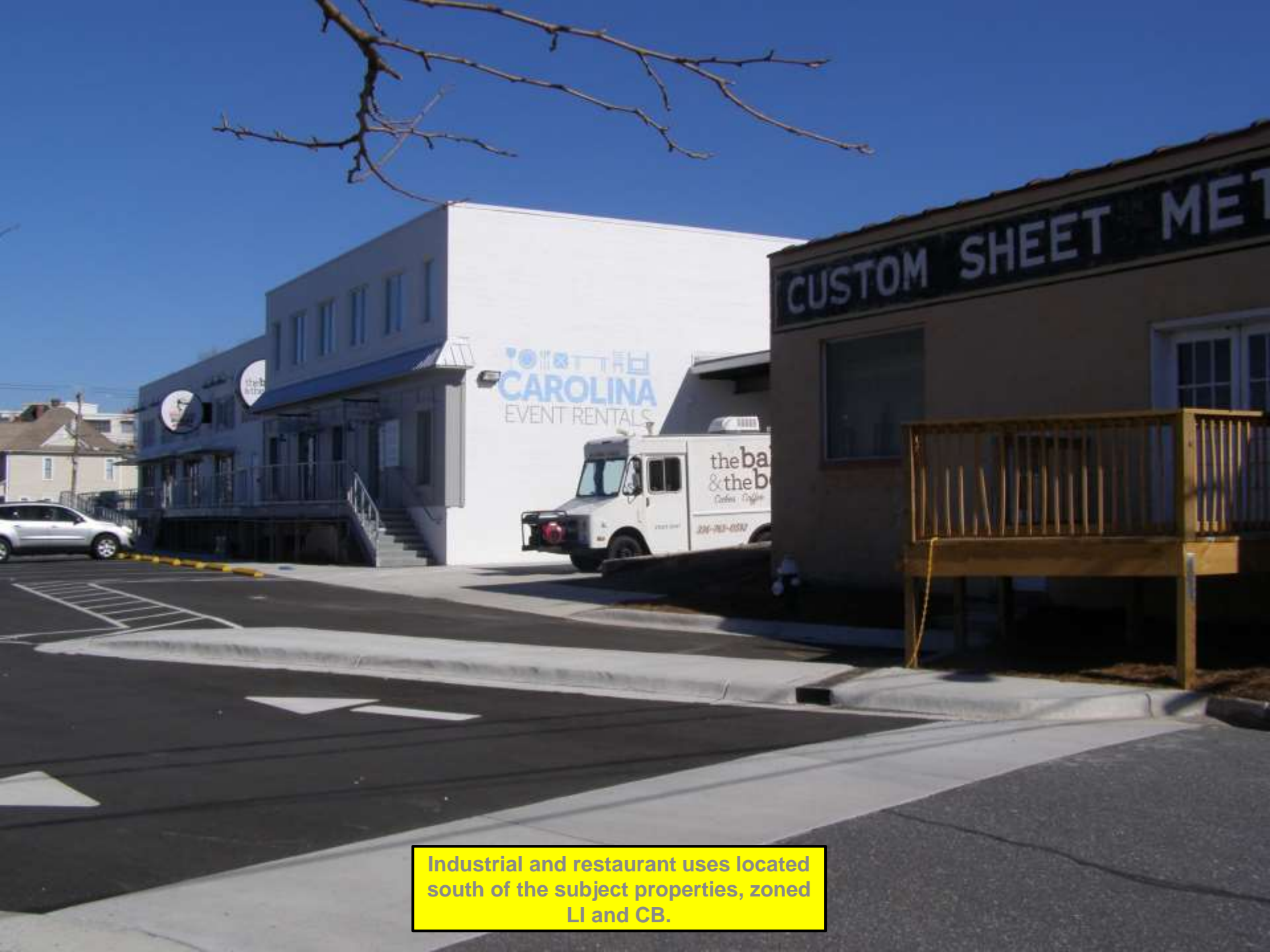
Industrial and restaurant uses located south of the subject properties, zoned LI and CB.