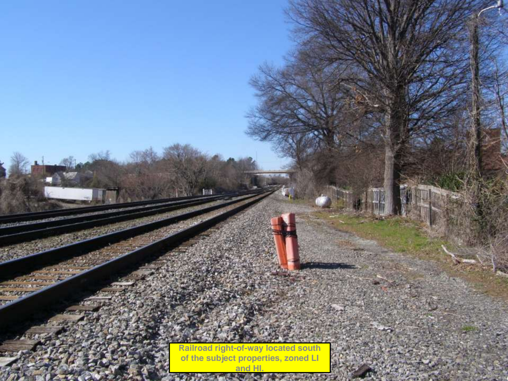
Railroad right-of-way located south of the subject properties, zoned LI and HI.