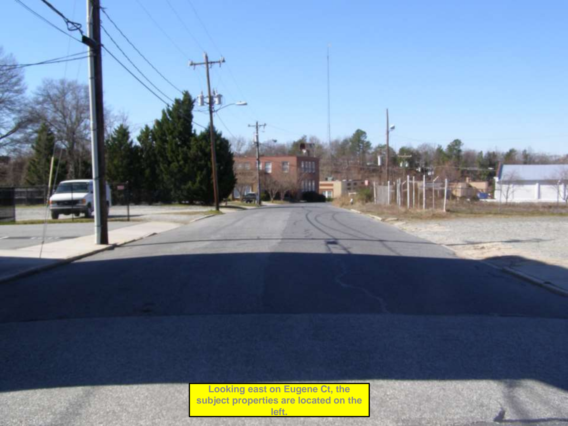
Looking east on Eugene Ct, the subject properties are located on the left.