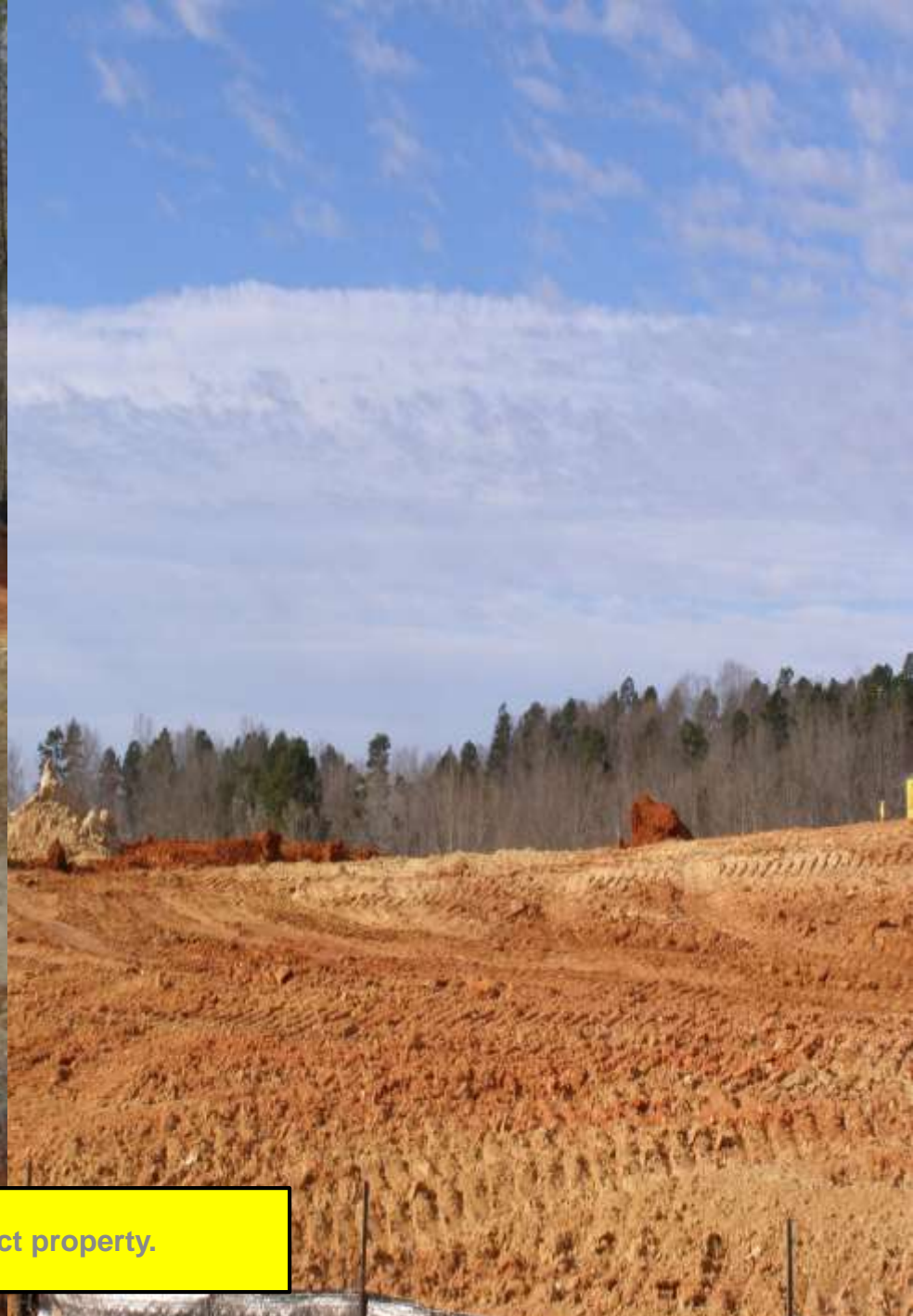
The subject property.