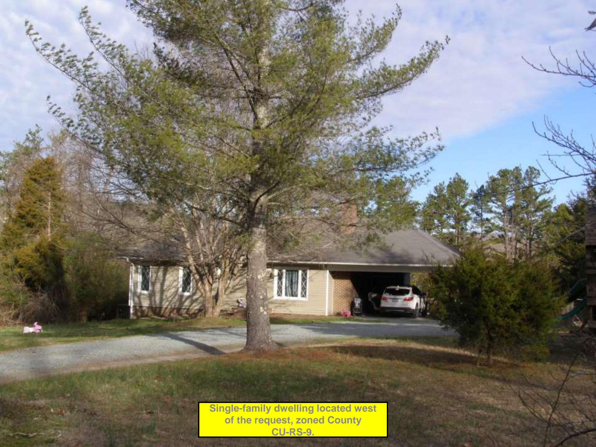
Single-family dwelling located west of the request, zoned County CU-RS-9.