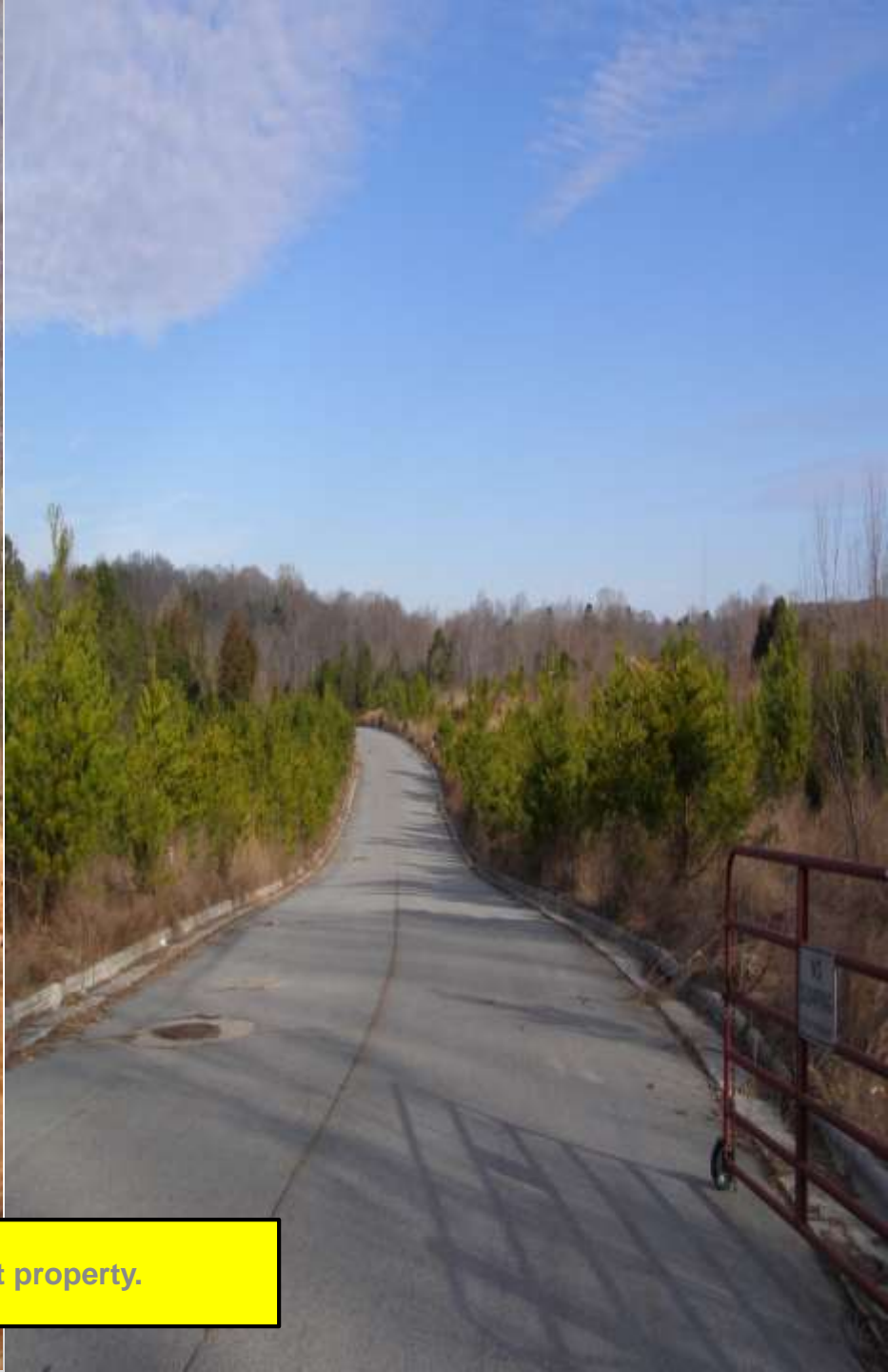
The subject property.