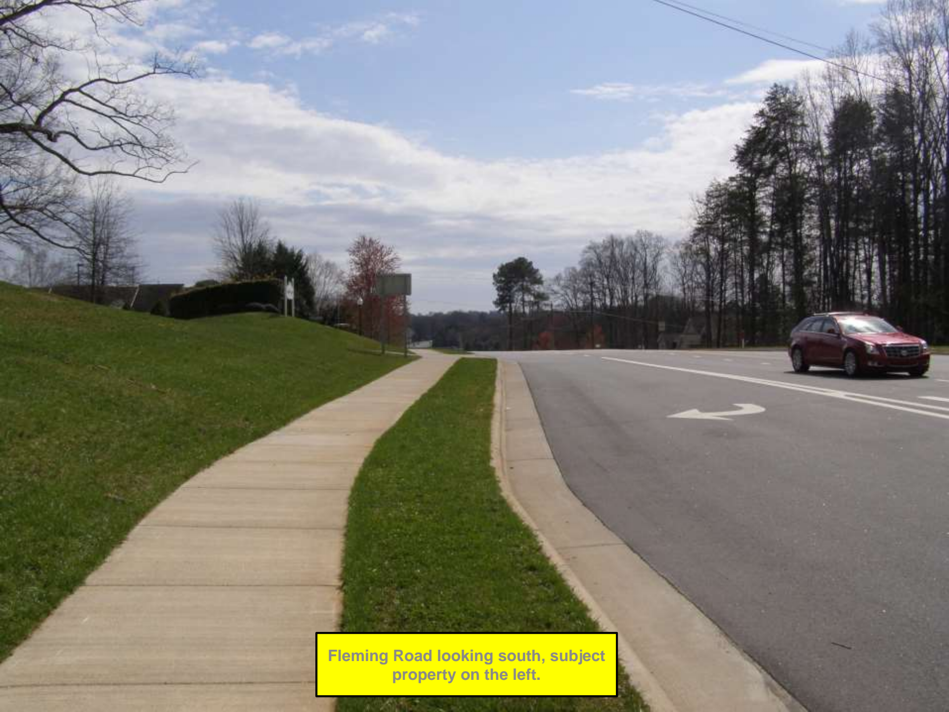
Fleming Road looking south, subject property on the left.