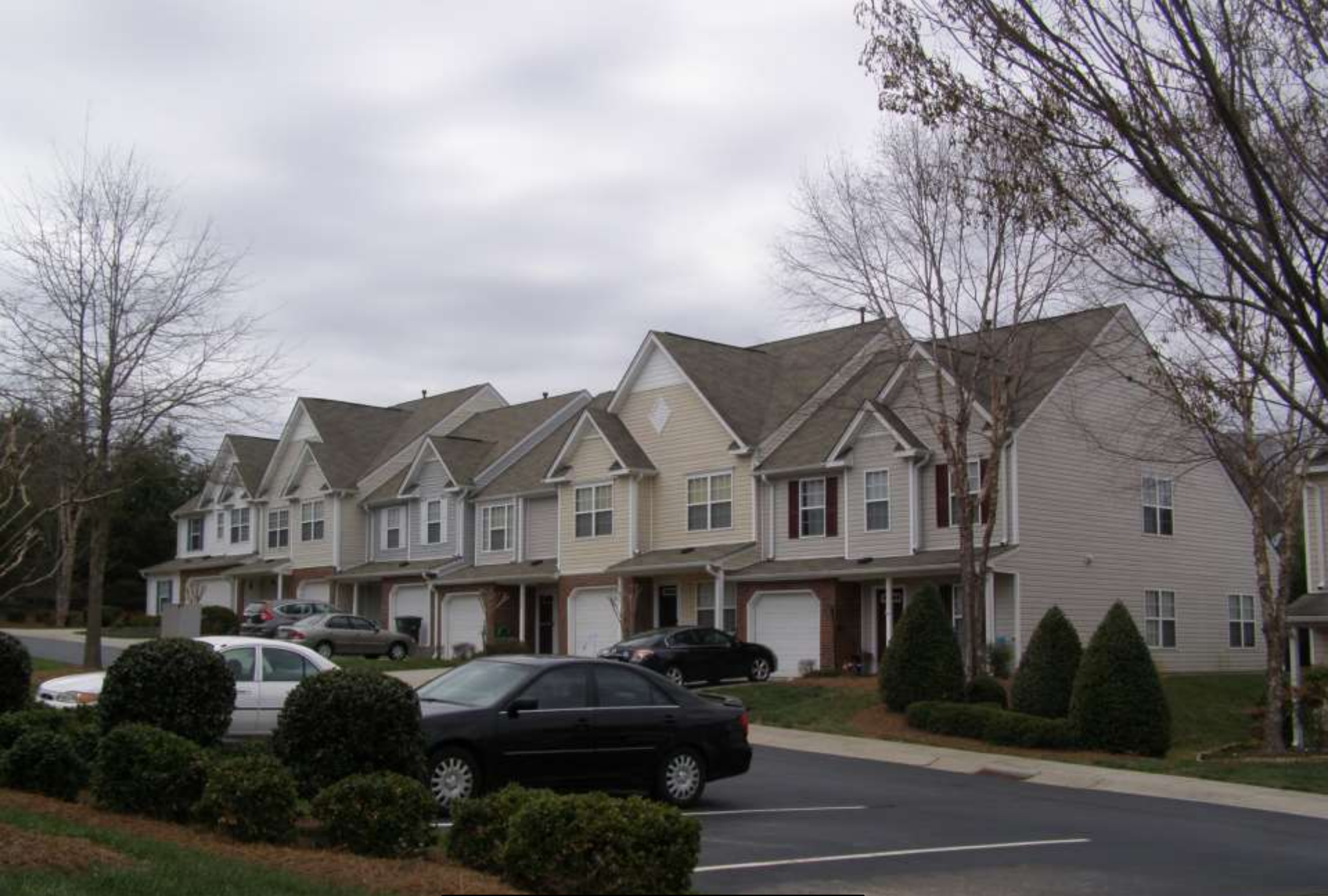
Townhouses located north of the subject property, zoned CD-RM-5.