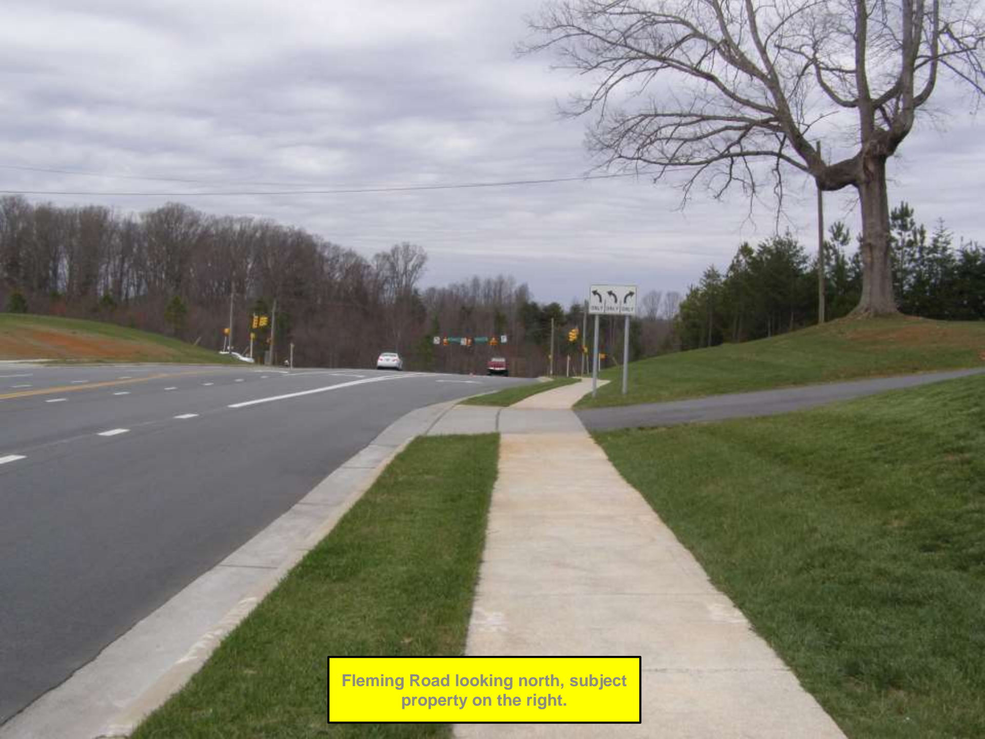
Fleming Road looking north, subject property on the right.