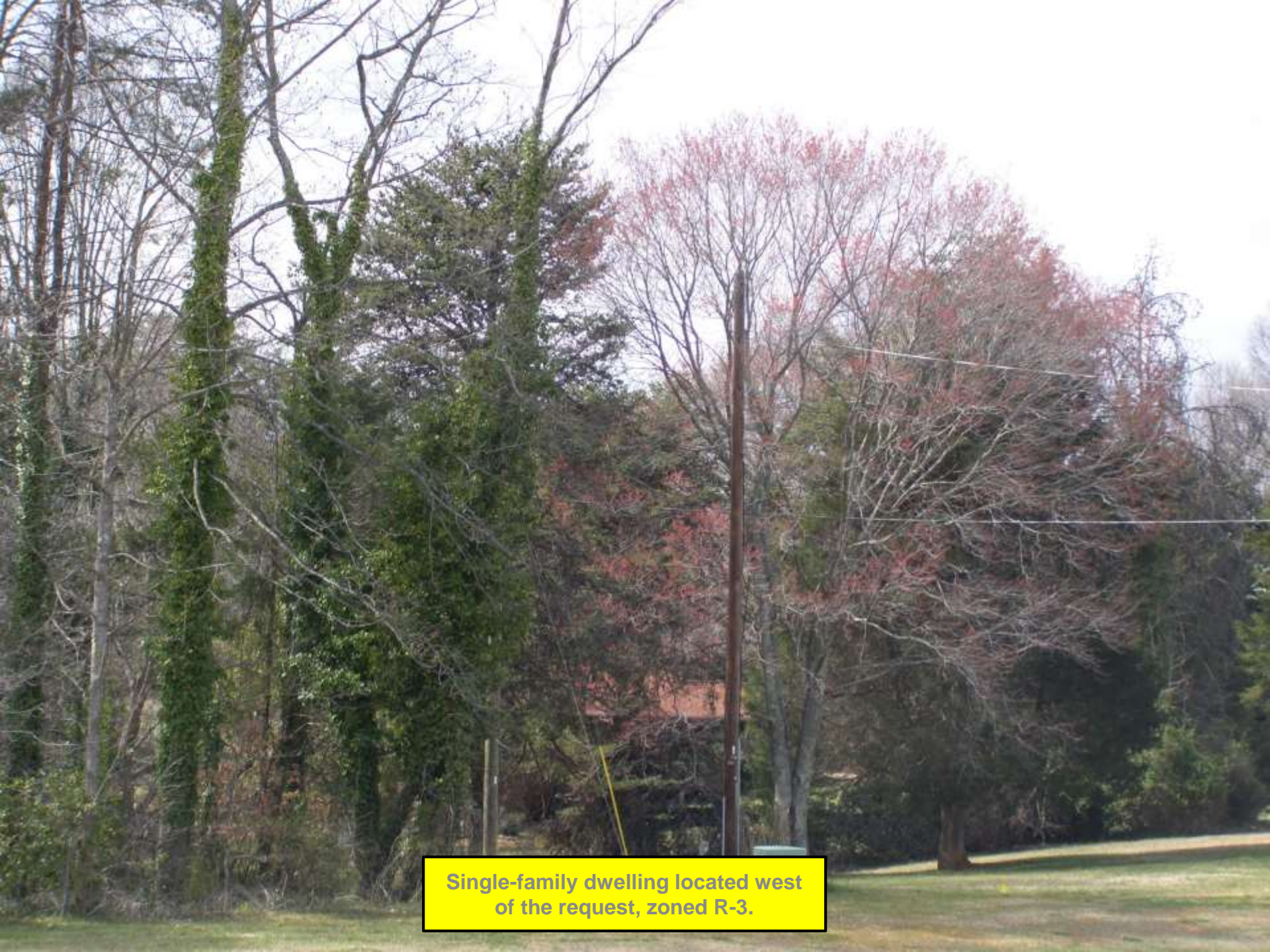
Single-family dwelling located west of the request, zoned R-3.