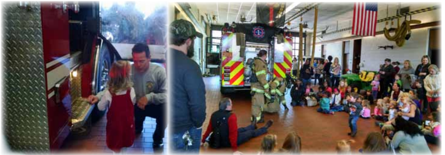
Storytime Field Trip to Fire Station 43