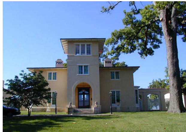
The Blandwood Mansion

Our Vision of Greensboro and its environs in the Year 2025 is one in which the City is recognized throughout the nation as an exceptional place in which to live, work, play and nurture future generations. It is this exceptional livability which defines our identity, contributes to our civic pride, and offers opportunities for all to participate fully in community life. We have achieved our vision by retaining and building on our heritage, embracing positive growth and change, and by balancing our priorities for: